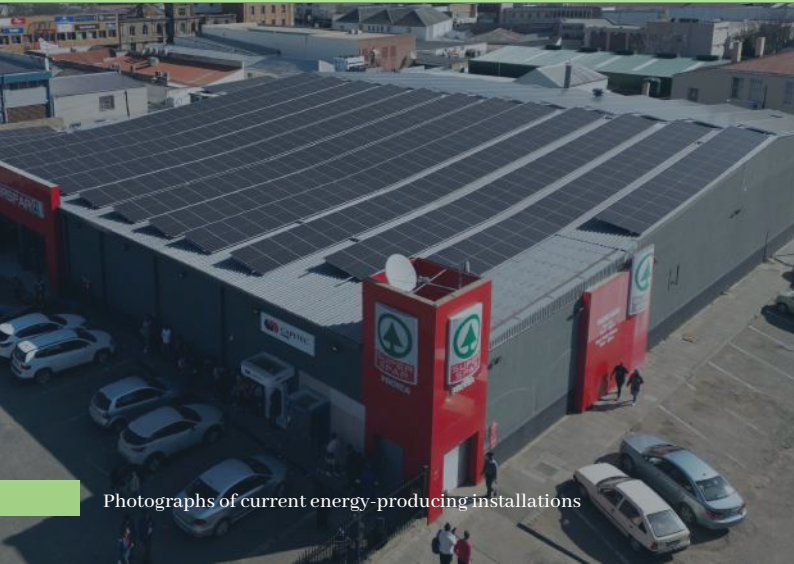
Photographs of current energy-producing installations

Installations incorporate the latest technology in solar panels, inverters, and battery storage, supported by proprietary software to manage and minimise energy utilisation.